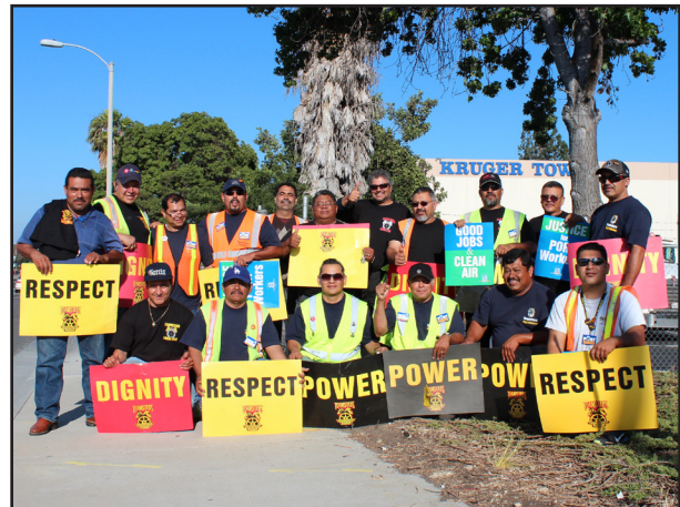
A group of Green Fleet drivers after participating in a demonstration.

that about 40 percent of a driver's compensation from Green Fleet leaves their pocket and simply pays for costs.